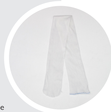
12" Vacuum Forming Hosiery with sewn toe