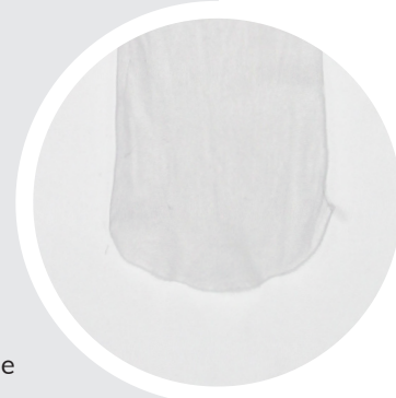
Vacuum Forming Hosiery with sewn toe